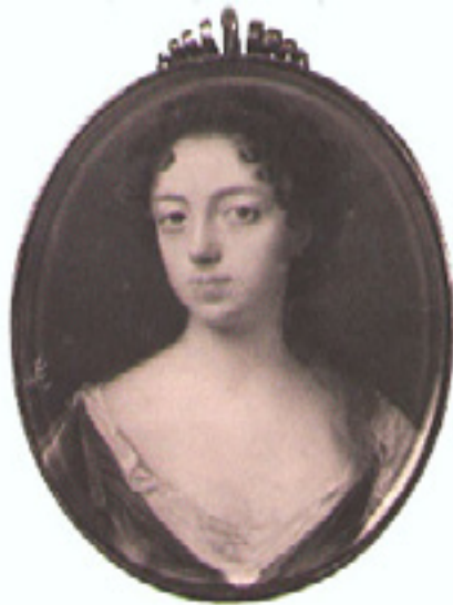
Portrait of Anne Finch

In an era known for the public and political poetry of Dryden, Swift, and Pope, the writer Anne Finch, Countess of Winchilsea (1661-1720), articulated a different literary and political authority from her position as a female aristocrat, once at the center of the court, and then for many years a political internal exile. She approached persons and the natural world with a sensitive receptiveness long before a similar emphasis in Romantic-era literature. In the landscape that Finch imagines, "the broad ox-eye stare[s] against the sun" (line 34) and "trees confused disdain the form